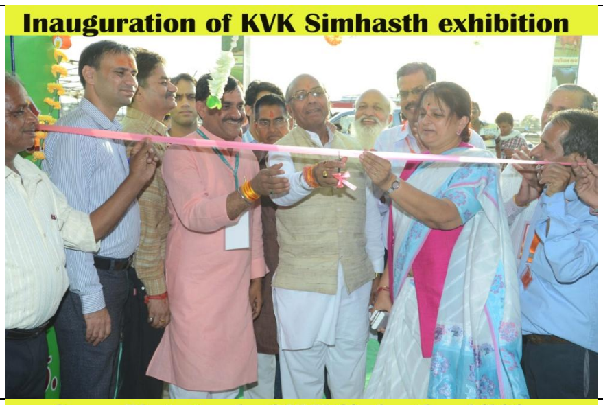
Group Photograph of KVK Simhasth exhibition